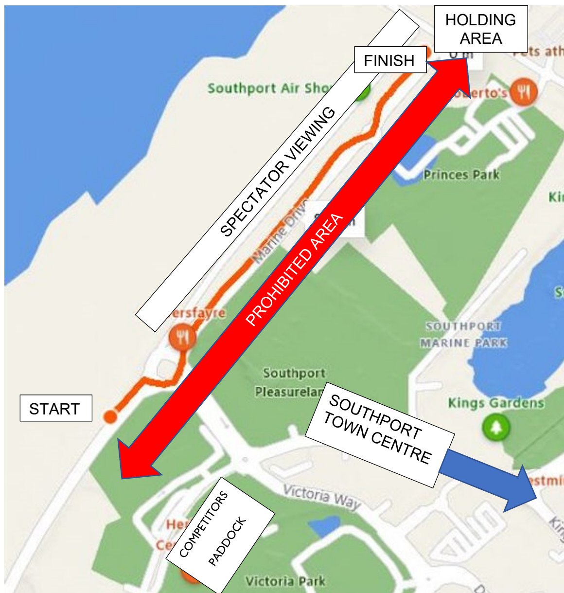
Southport Classic and Speed Sprint Revival Course – 820m/900yd